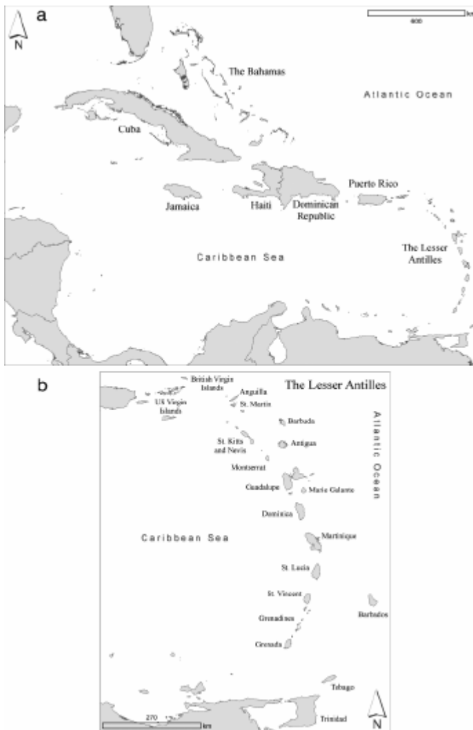
Figure 1. Map of the insular Caribbean.

The insular Caribbean contains approximately 11 424 544 ha of forested lands, which can be subdivided into 5 328 085 ha (47%) of dry forest, 3 593 830 ha (32%) of moist forest, 1 417 606 ha (12%) of pine forest, 730 356 ha (6%) of wet forest, and 354 665 ha (3%) of shrubland (16). Forest fires occur mainly in dry forest types (500–1000 mm mean annual rainfall), where most human settlements are located, and in the dry seasons (typically January to June, but with variation often bimodal) (17–22). Fire-maintained pine forests have recurring fires defined by specific fire regimes (characteristics that define fire behavior in an ecosystem, e.g., intensity, frequency, burn severity, seasonality, and pattern of burning) that help to maintain the forest structure and species composition (23, 24). Lowland moist forests and montane forests with higher rainfall (1000 and more mm y -1 ) are less susceptible to fires, but they can burn in exceptionally dry years.